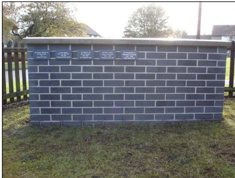
The Memorial Wall