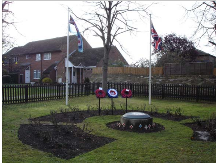
Memorial Garden Remembrance Day 2009